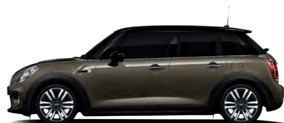
MINI 5-DOOR HATCH.