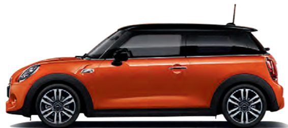
MINI 3-DOOR HATCH.